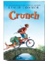
Leslie Connor Waiting for Normal, CRUNCH

Tickets $40 per person (gratuity included)